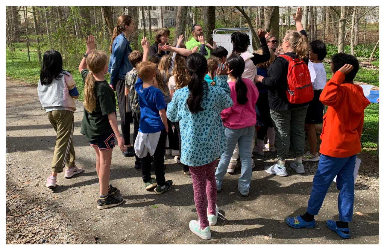
Canterbury Woods students gather around the whiteboard to tally their findings

FACC did the Follow the Water program in the past at Little Run Elementary, upstream from Canterbury Woods, back in 2018. Two rain gardens were installed at that time, but are now badly in need of invasives removal.