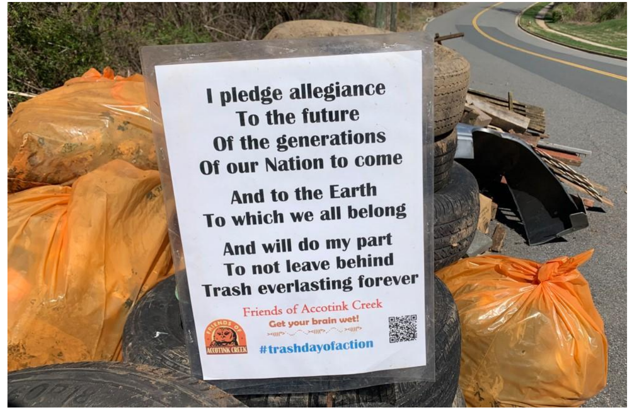
West End Rugby cleanup results on Americana Drive

Our next Americana Drive cleanup will be on <u>Clean the Bay Day</u>, June 1<sup>st</sup>.